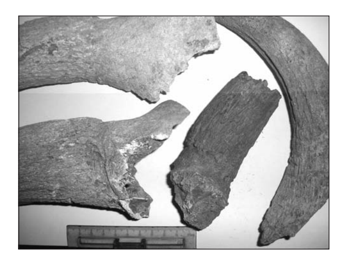
Figure 1. Bovine horn base fragments from Belovode

right horn bases originated from different animals. It can be assumed that the consumption of adults only indicates the cattle farming activity, since young animals would have been used for breeding. These finding are in accordance with archaeological observations concerning the activities and society development of neolithic communities. Furthermore, developing farming settlements were scattered throughout the Middle and Far East and also on the Balkan Peninsula during the Neolith. These findings are similar to those from Gomolava and Vinča (Bokonyi, 1968, 1974, 1988; Legge, 1990).