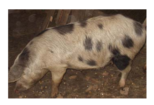
Figure 3. Head of Resavka breed (municipality Kuršumlija)

Conditions of housing and nutrition: Pigs are kept around the house, in woods or orchards (Figure 5), which depends on the number of heads and size of the owner's farm/household. In the winter period, animals are housed in cheep, wooden pig sties (planks, branches of wood, sticks, etc.) (Figure 4). Rearing of pigs is extensive.