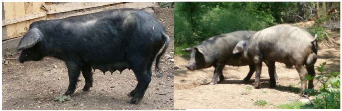
Slika 1. Krmača rase moravka u slaboj kondiciji (selo Babice, opština Kuršumlija) Figure 1. Sow of Moravka breed in poor condition (Babice village, municipality Kuršumlija)