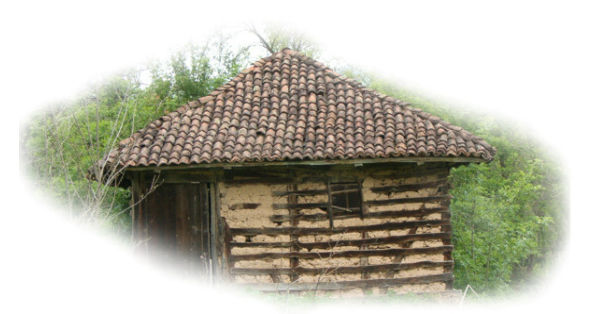
Slika 4. Tipovi svinjaca Figure 4. Types of pig sties